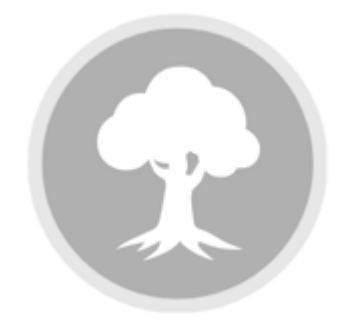
People in Hampshire enjoy a rich and diverse environment