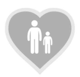
People in Hampshire live safe, healthy and independent lives

Policy and Resources Select Committee June 2022